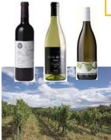
Wine and vineyards