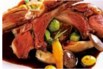
Cuisine (Wild game meat)