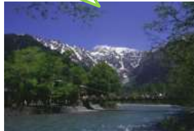
Tourism (Kamikochi, the Japanese Alps)

Total Area of Natural Parks The 3rd Largest