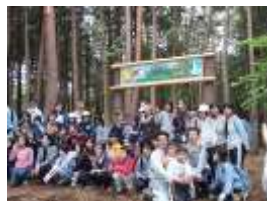
Human exchanges (experiencing forests)