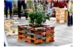
Local revitalization by wood products at shopping areas