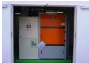
Using biomass heat at public facilities