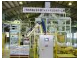
Producing high quality wood pellets