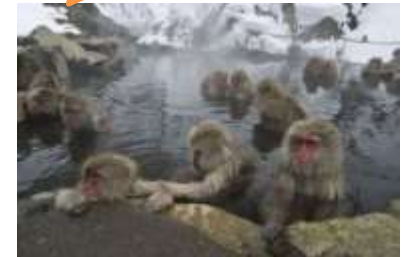
Hot Springs (“Snow Monkeys” at Jigokudani Wild Monkey Park)