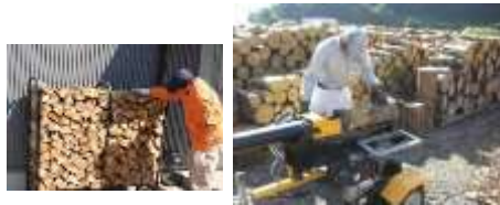
Fire wood delivery scheme at welfare facilities