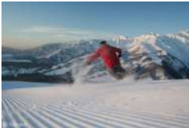
Outdoor Activities (Host city of the 1998 Nagano Winter Olympics and Paralympics)

Total Area of Natural Parks The 3rd Largest