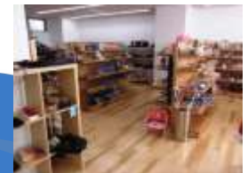
Wood products in urban areas