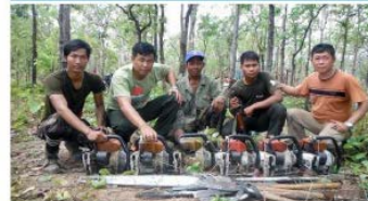
Members of a Keo Seima Wildlife Sanctuary patrol pose for a photo with confiscated chainsaws in Monduliri, where Disney has purchased carbon credits.

Home National Business Lifestyle Sport Post Weekend Post Property