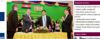
Disney carbon deal sets stage for more partnerships

The Walt Disney Company has purchased $2.4 million in carbon credits in the forests of Monduliri.