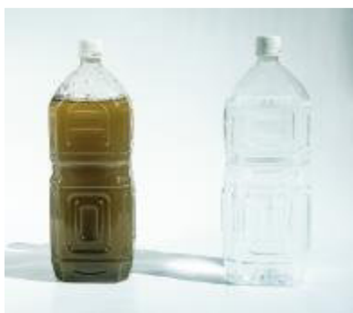
Water Purification (Before & After)

The System has been introduced to medical and educational facilities and rural areas in countries vulnerable to water pollution such as Indonesia, Vietnam, Senegal and Mauritania, drastically reducing the outbreak of diarrhea, fever and other illnesses. The System has also transformed people’s lives. Local residents are now released from the chore of pumping water from the well and they have shifted themselves to production and learning activities. Economic development in rural areas and villages has also been achieved through new businesses such as water delivery, flush cleaning and ice making. Eying the System as a contributor to social infrastructure development while enhancing corporate awareness at the same time, Yamaha Motor is actively introducing the System to areas with water supply but without purification technology in cooperation with other donors.