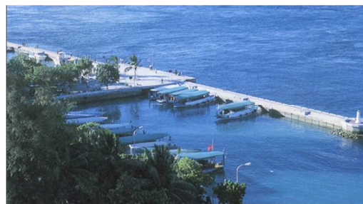
Visual Illustration of Seawall