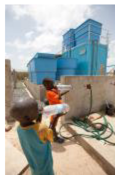
Children gulping Clean Water (Senegal)