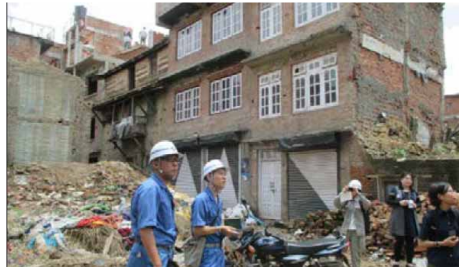
Nepal Post-Disaster Reconstruction Support