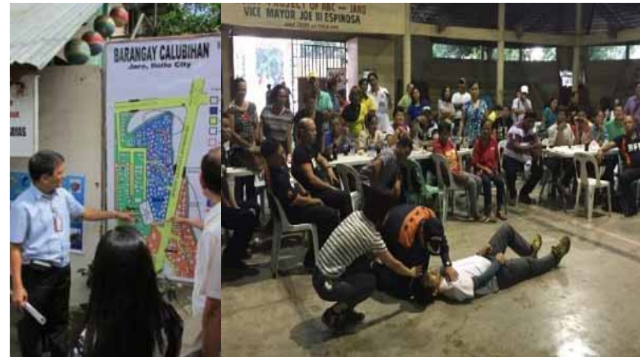
Iloilo City Community Disaster Prevention Project