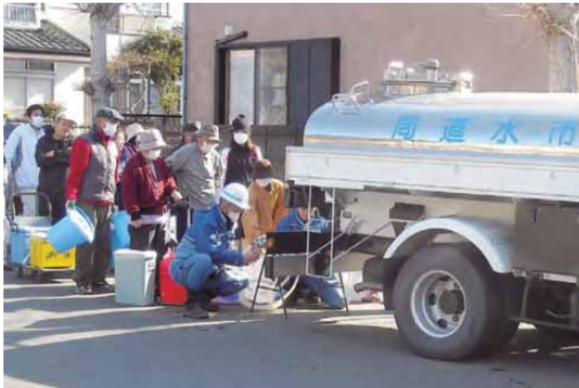
Emergency Water Supply