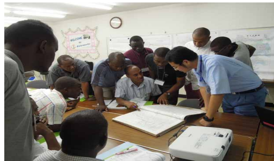
Trainees from Africa