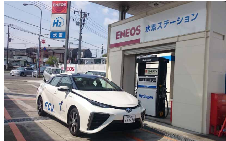
○ Encouraging installation of hydrogen stations