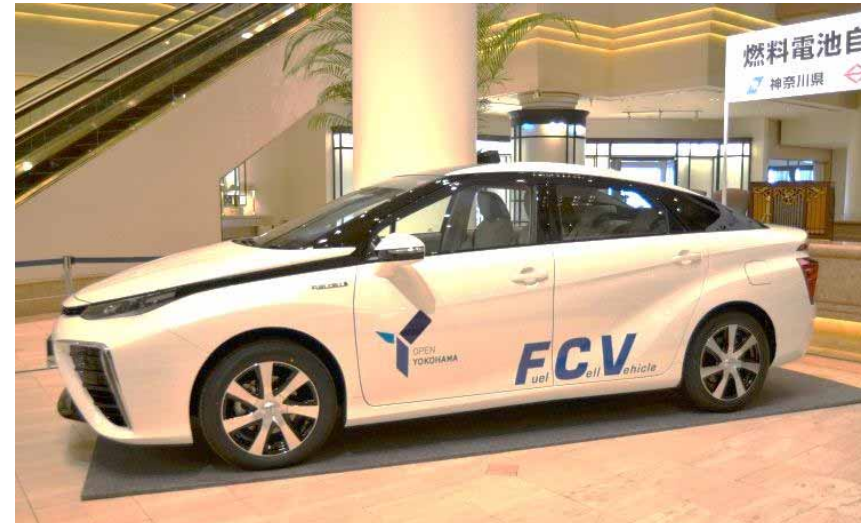
○ Encouraging the spread of fuel cell vehicles