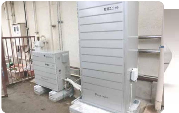
○ Spreading stationary fuel cells