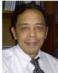
Ucok Wrsiagian Indonesia