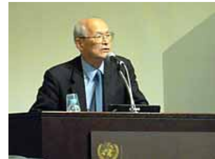
Declaration of LoCARNet launch (April 2012, Tokyo)