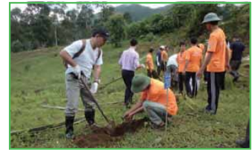
The tree-planting event by a Japanese company and local residents

Deforestation caused by unsustainable development is one of the reasons of disturbing the sound growth of developing countries. REDD+ can, comparing with ordinary “nature conservation” and CSR, widely support social development of developing countries through conservation and sustainable management of forest.