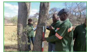
Measuring reduction of emission

Through REDD+, credits for reducing greenhouse gas emissions may potentially be obtained. Actually more and more companies obtain and sell such emission-reduction credits for greenhouse gases issued by the Verified Carbon Standard (VCS) and the other schemes. ses with the schemes such as the Verified Carbon Standard (VCS).