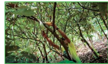
Developing a business with agricultural products sustainably produced from a conserved forest

Huge and rich forests in developing countries are a great potential fields for agricultural and forestry businesses. Internationally agreed REDD+ framework can be useful for developing sustainable businesses which generate enormous business opportunities.