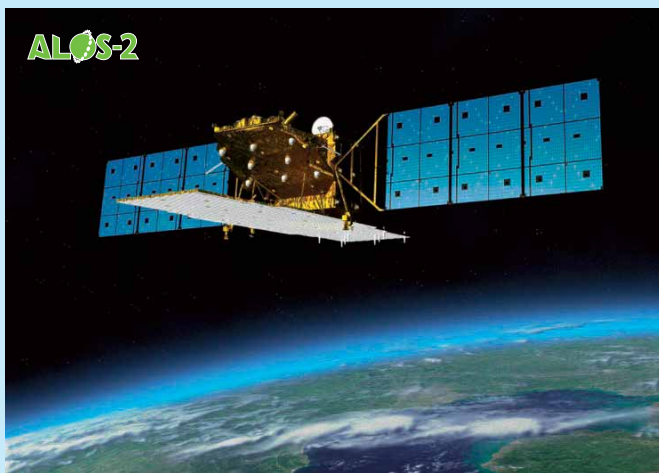
JAXA's Advanced Land Observing Satellite (ALOS-2)

Japan International Cooperation Agency (JICA) and Japan Aerospace Exploration Agency (JAXA) launched a new initiative for Improvement of Forest Governance in June 2016. In this initiative, JICA and JAXA develop an early warning system for deforestation of tropical forest: JICA-JAXA Forest Early Warning System in the Tropics by using JAXA's Advanced Land Observing Satellite (ALOS-2).