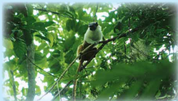
The endangered Pied Tamarin ( Saguinus bicolor ) (Brazil)

Forest can change the world - Initiative for Improvement of Forest Governance will contribute to global tropical forest and biodiversity conservation and climate change mitigation by using Japan's advanced satellite technology and multi-stakeholder partnerships