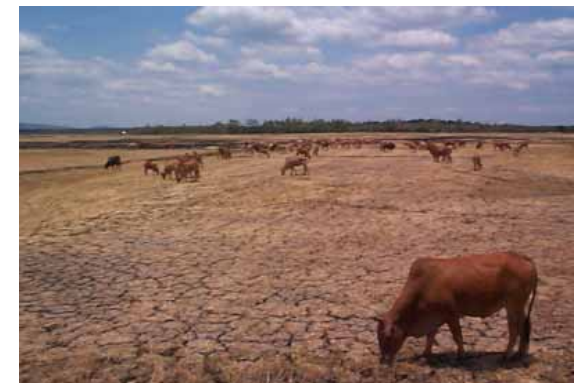
Drought in the southern Vietnam

Sustainable Natural Resource Management Project