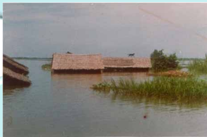
Inundated houses in the central Vietnam